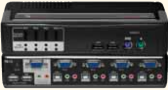
SwitchView Multimedia switch

The all-in-one SwitchView MM (Multimedia) desktop KVM switches let you switch between USB or PS/2 systems, share your USB devices and control multimedia applications. With one SwitchView Multimedia switch, you can control multiple PCs and share access to your USB devices: digital camera, CD-ROM, PDA, scanner or printer. The SwitchView Multimedia KVM switches are available in 2 and 4 port models, with USB 1.1 and USB 2.0 support.